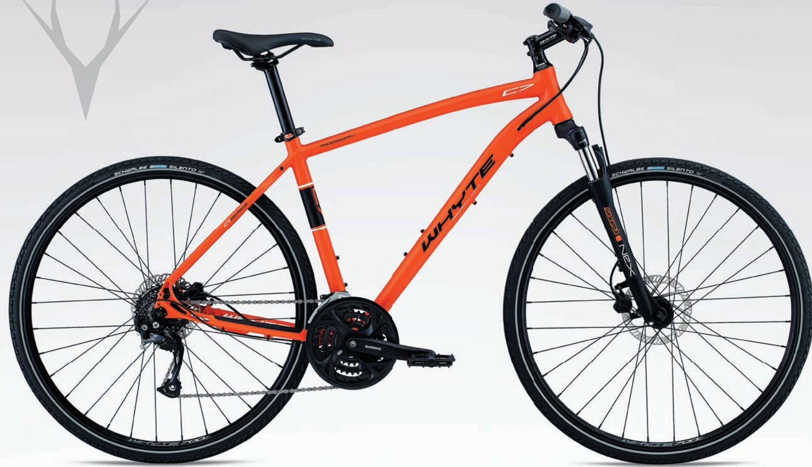
Lightweight aluminium frame / integrated kickstand mount / SR Suntour suspension fork with Hydro lockout / Shimano 3x9spd gearing / Schwalbe 37c Tyres / Tektro hydraulic disc brakes ALL TERRAIN/LEISURE - C7 SERIES