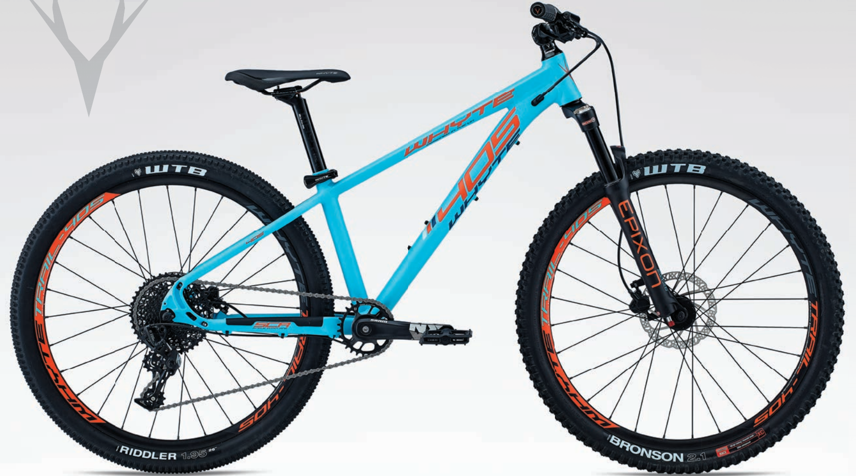
SRAM NX 1 by 11 drivetrain with NX Trigger shifter/ SR Suntour Epicon fork with adjustable air spring to tune to rider weight / Tailored front and rear tyres to exploit every ounce of grip and performance YOUTH 26ER TRAIL HARDTAIL - 400 SERIES - 100MM