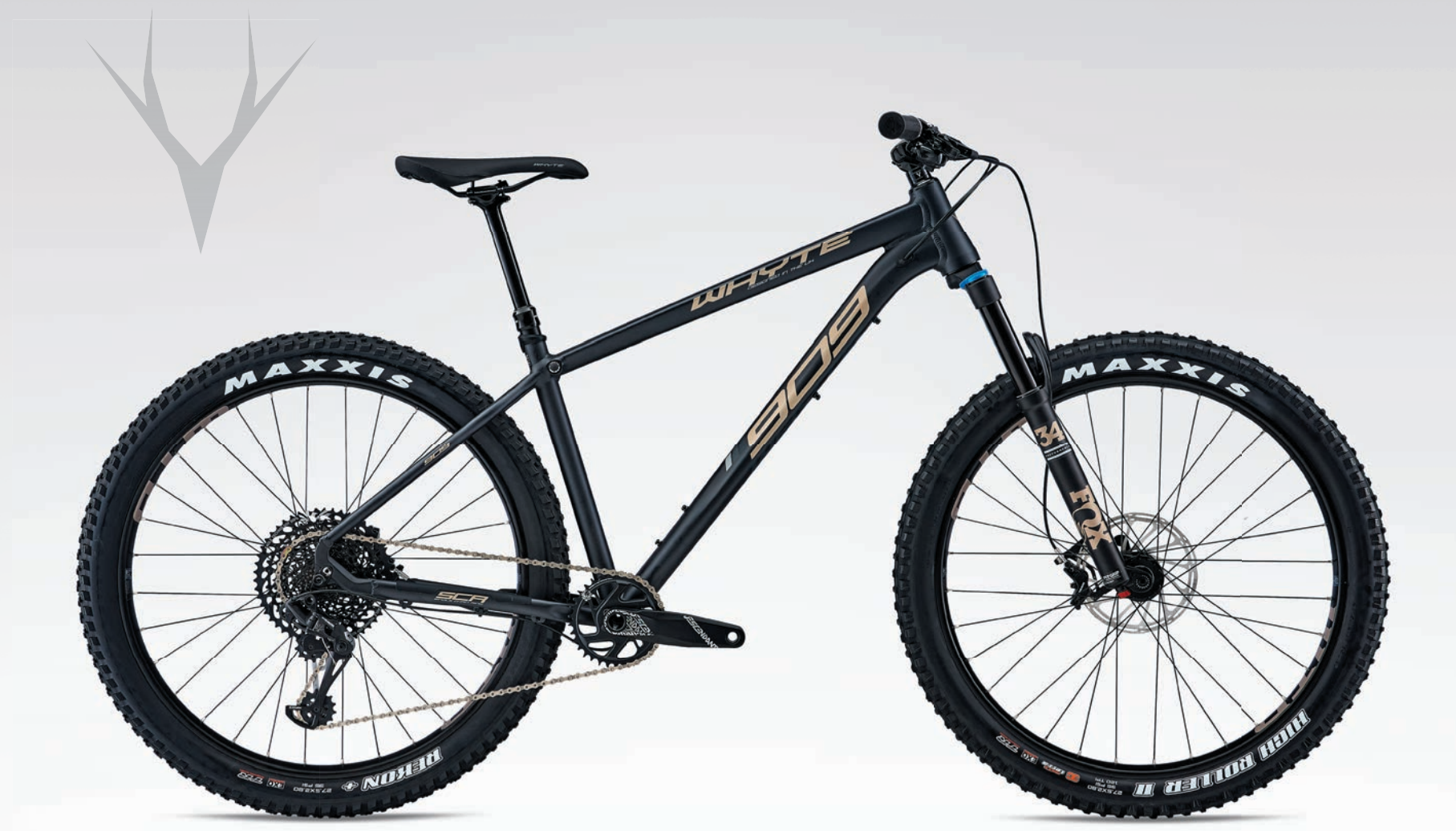
SRAM GX Eagle 12 speed drivetrain/ Hope PRO4 Boost rear hub with XD Driver / Fox 34 Performance fork with GRIP Damper TRAIL/ENDURO HARDTAIL - 900 SERIES - 130MM