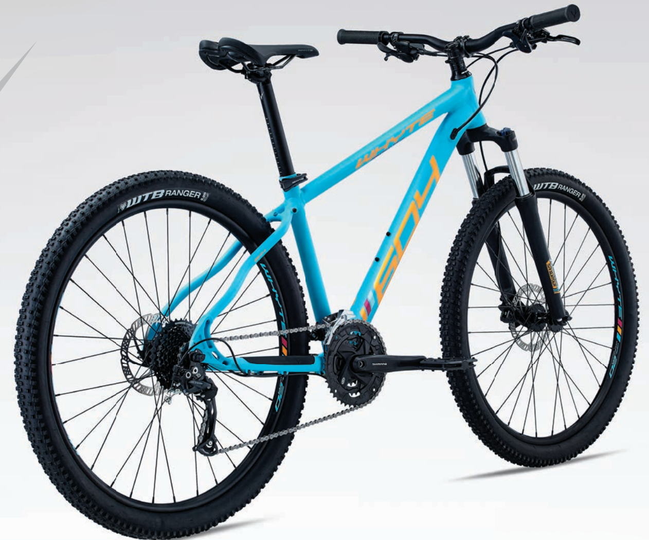
Lightweight aluminium frame with compact geometry for smaller riders / Internal cable routing / SR Suntour suspension with 100mm Travel and lockout feature / 2.25 WTB Ranger Tyres SPORTS HARDTAIL - 600 SERIES - 100MM