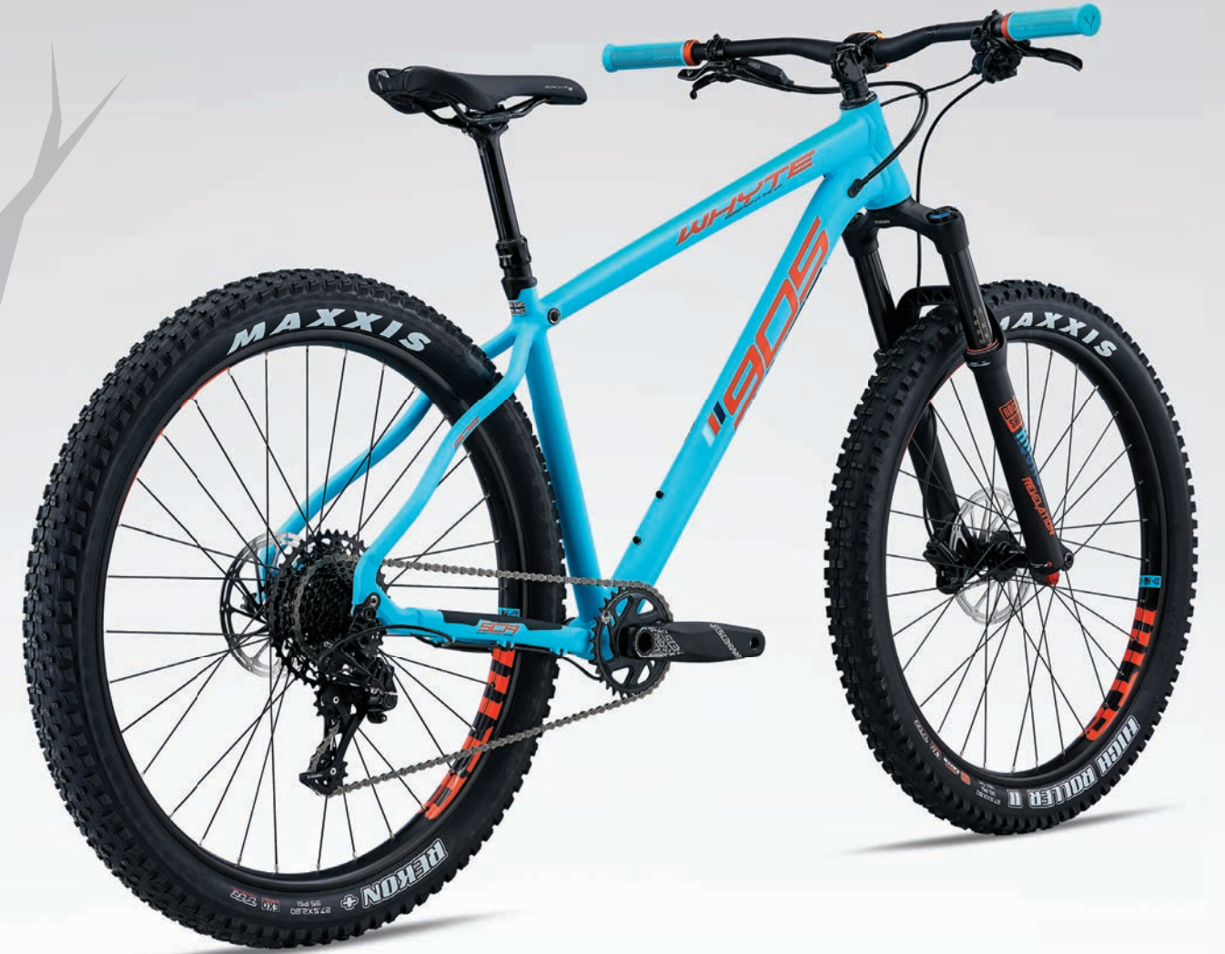
RockShox Revelation RC fork / Internally routed Whyte Drop.it Seat Post / Whyte custom 760mm bar and short gravity stem/ Maxxis front and rear specific 2.8" TR tyres and WTB STp i35, 35mm wide rims TRAIL/ENDURO HARDTAIL - 900 SERIES - 130MM