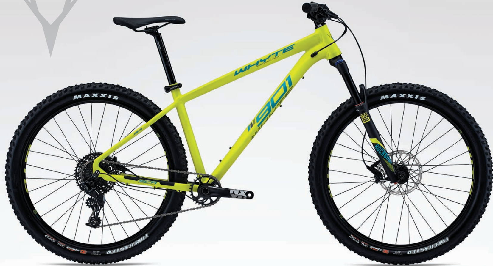
Lightweight and stiff 6061 aluminium frame / RockShox Recon Gold RL fork / Whyte custom 760mm bar and size specific stem / WTB TCS rims and 2.6" Maxxis Forekaster tyres TRAIL/ENDURO HARDTAIL - 900 SERIES - 130MM