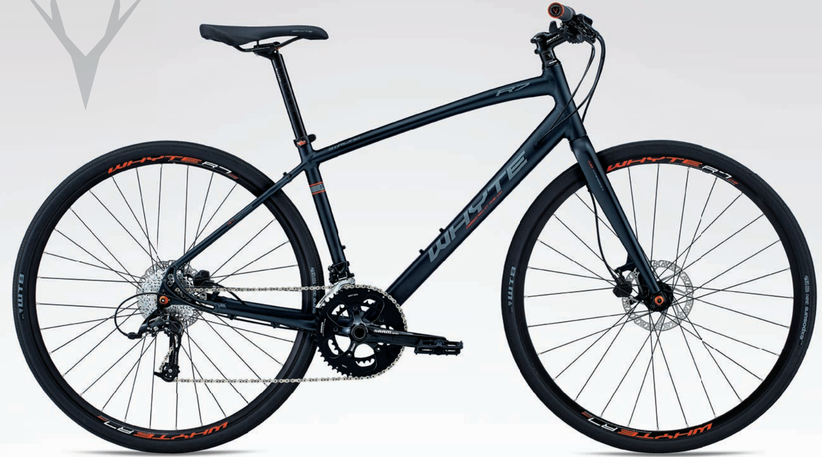
SRAM X5/Via groupset / lightweight aluminium frame and carbon fibre fork / Powerful Tektro hydraulic disc brakes FAST URBAN/COMMUTER - R7 SERIES