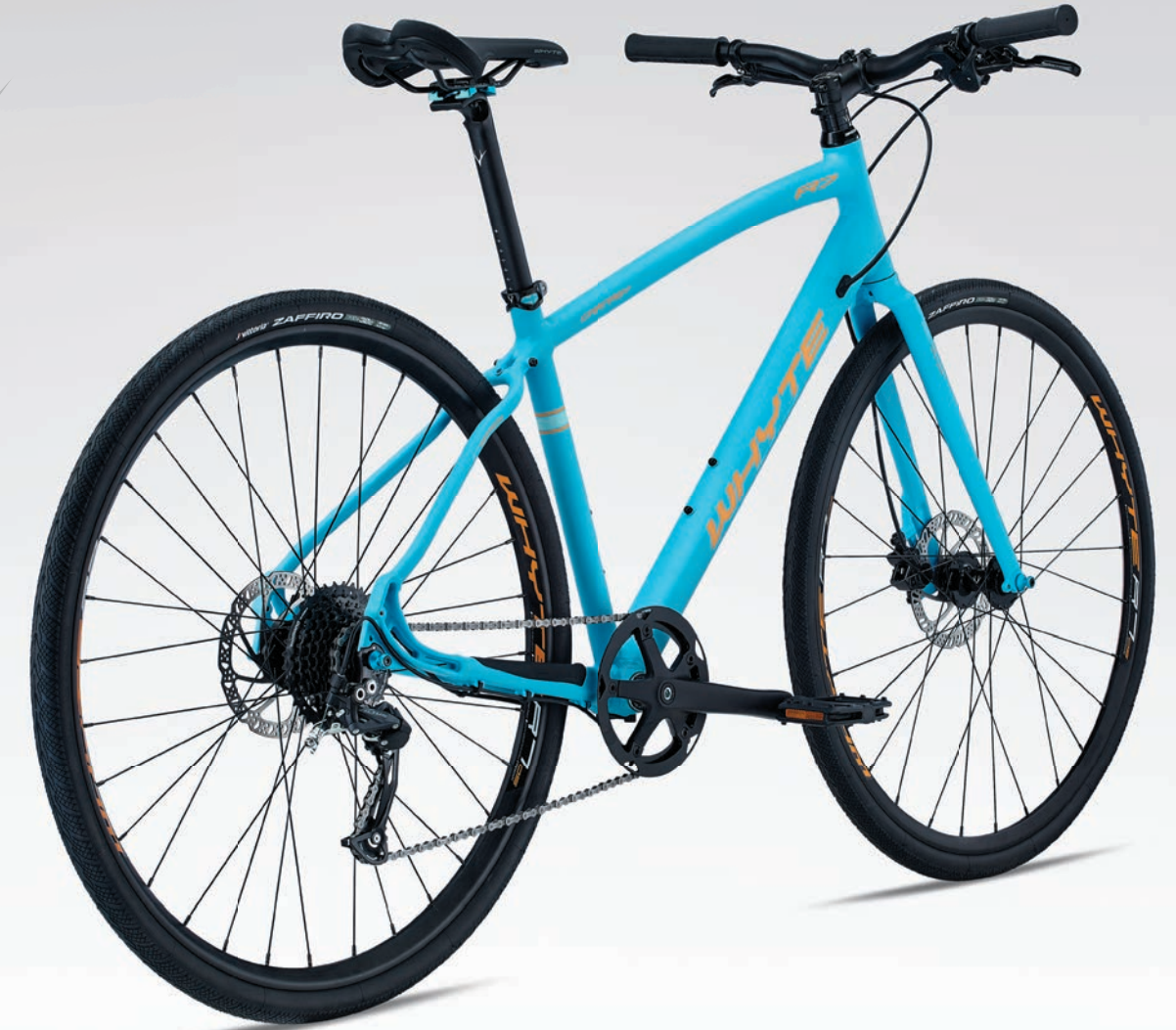
Lightweight aluminium frame with compact geometry / Tektro hydraulic disc brakes / Vittoria 32c Tyres / 1x9spd Shimano drivetrain for urban simplicity FAST URBAN/COMMUTER - R7 SERIES