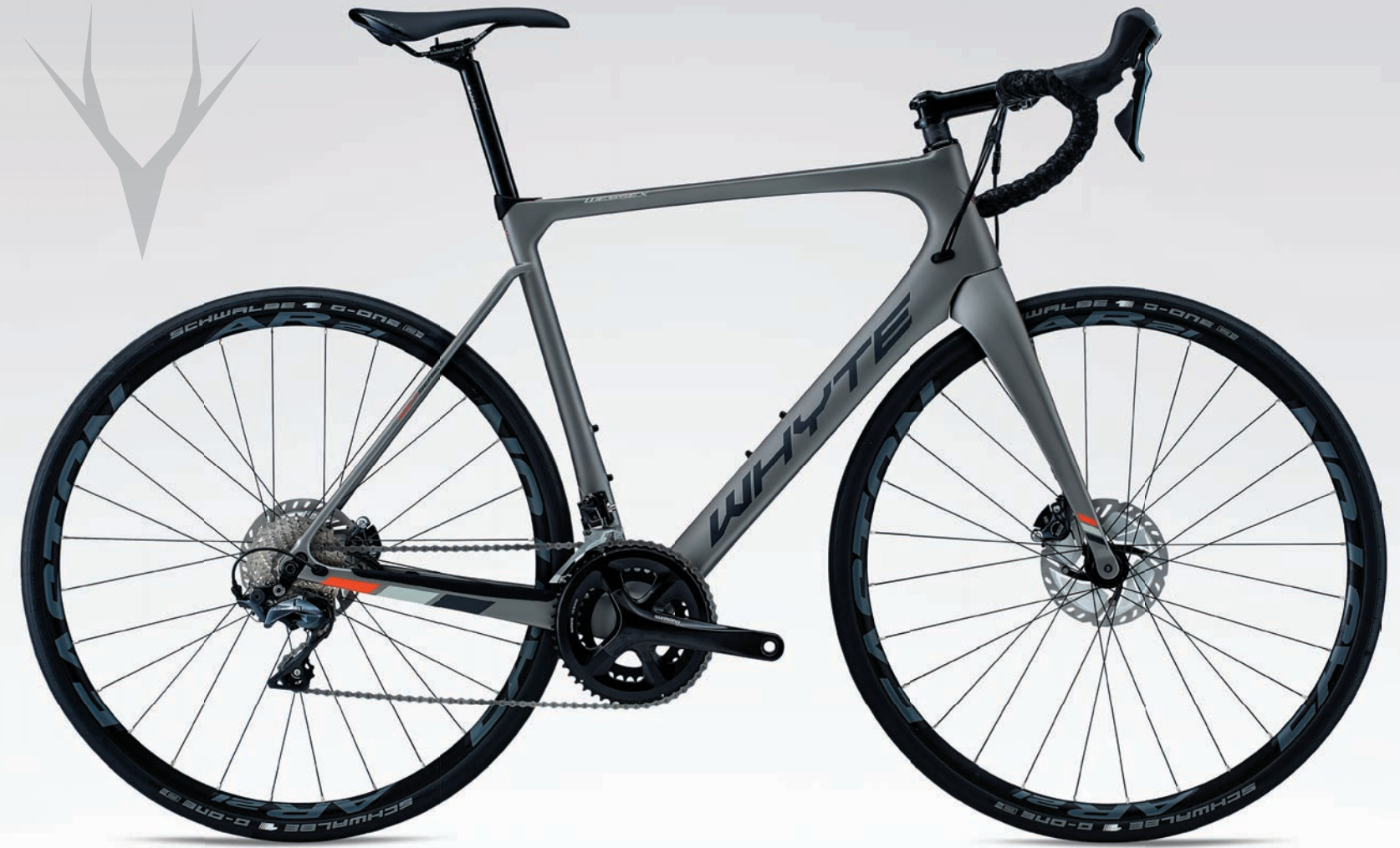
Shimano Ultegra flat mount disc brakes / Schwalbe G-One Speed tubeless ready tyres / Easton AR 21 Tubeless ready rims/ Shimano 105 wide range rear cassette / Full internal cable routing CARBON PERFORMANCE ROAD - RDC7 SERIES