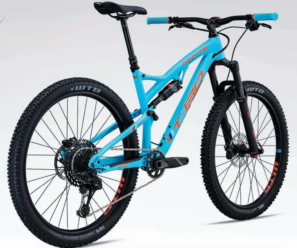
RockShox Revelation RC fork, Monarch DebonAir shock / SRAM GX Eagle Groupset / Stealth Reverb / WTB STs i29 29mm TCS sleeved rims T-130 TRAIL SUSPENSION - 130MM