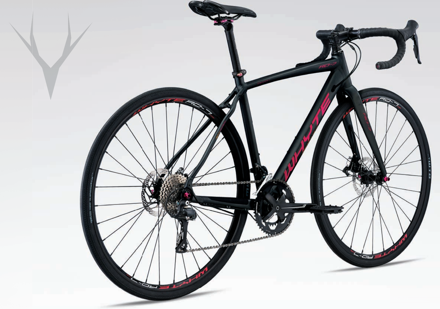
Compact Geometry Disc-specific aluminium frame with carbon fibre fork / TRP HyRd mechanical/hydraulic disc brakes / Shimano Sora 9spd super compact gearing with wide range rear cassette SPORTS ROAD/COMMUTER DISC - RD7 SERIES