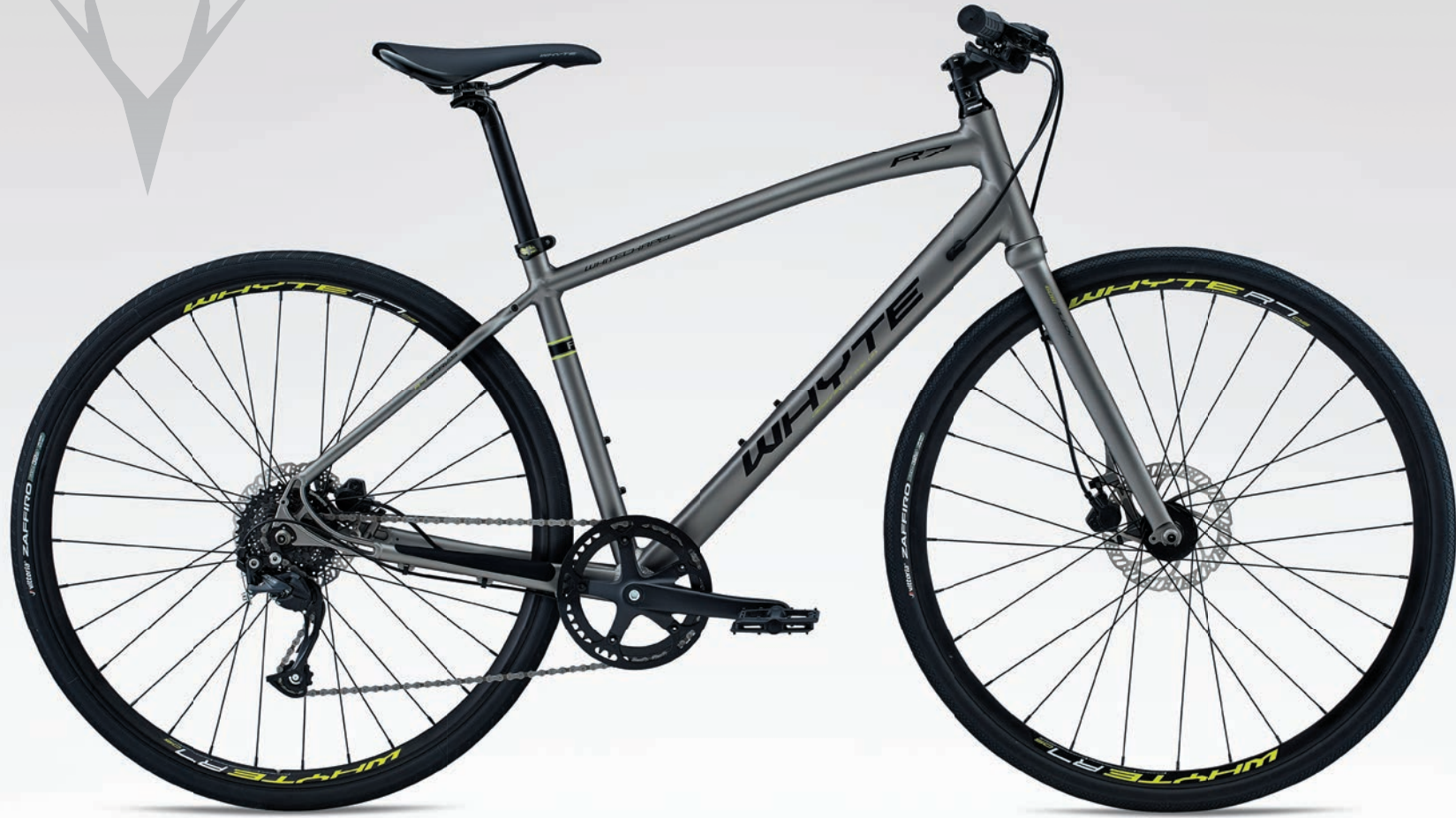
Lightweight aluminium frame / Tektro hydraulic disc brakes / Vittoria 32c Tyres / 1x9spd Shimano drivetrain / for urban simplicity FAST URBAN/COMMUTER - R7 SERIES