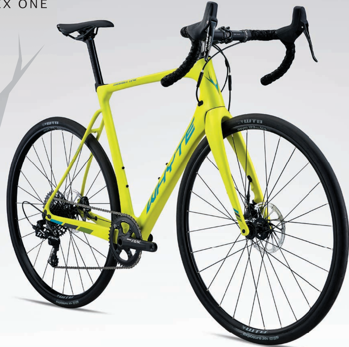
SRAM Apex flat mount disc brakes / WTB Exposure 30c TCS Tubeless Ready tyres / WTB Asym i23 TCS, Tubeless ready rims/ SRAM APEX 1 wide range drive-train CARBON PERFORMANCE ROAD - RDC7 SERIES