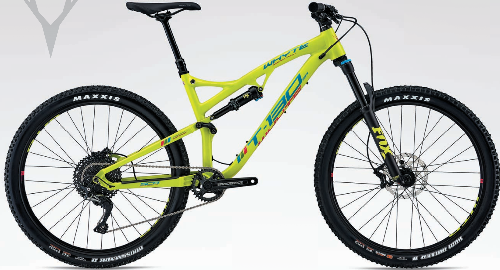
Fox Rhythm 34 front fork and Fox DPS rear shock / Shimano SLX/RaceFace 1 by 11 drivetrain / Whyte Drop.it Dropper Post T-130 TRAIL SUSPENSION - 130MM