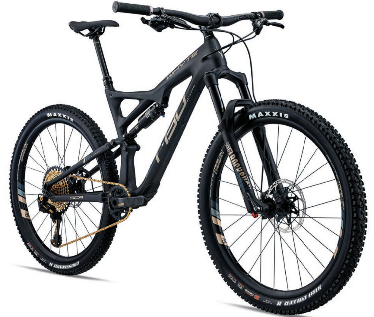
SRAM XX1 Eagle Gold 12-speed drive-train / Rockshock suspension and Reverb Stealth seatpost with X1 Remote T-130 TRAIL SUSPENSION - 130MM