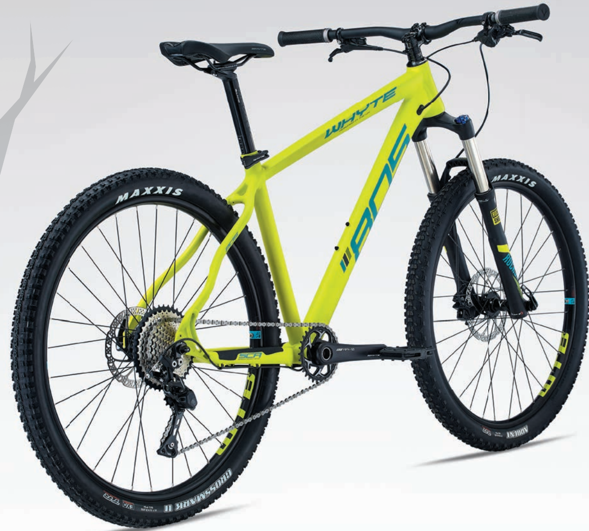
Tubeless Ready rims and Tyres / Shimano Deore 1 by 10 Drive-train / RockShox Recon Silver fork with TurnKey lockout and 15mm Boost Maxle TRAIL HARDTAIL - 800 SERIES - 120MM