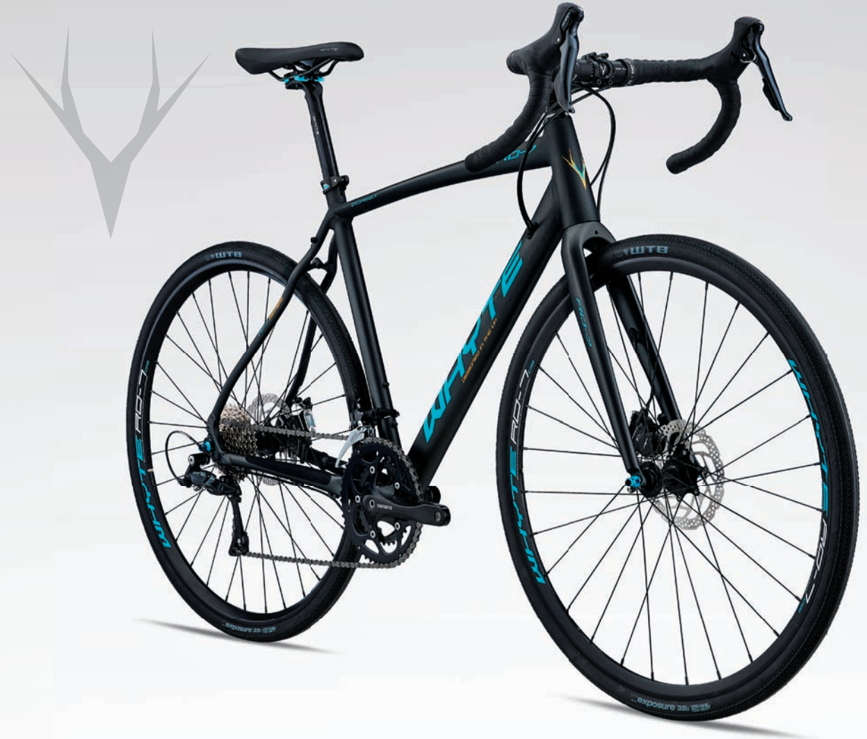
Disc-specific aluminium frame with carbon fibre fork / TRP HyRd mechanical/hydraulic disc brakes / Shimano Sora 9spd compact gearing with wide range rear cassette SPORTS ROAD/COMMUTER DISC - RD7 SERIES