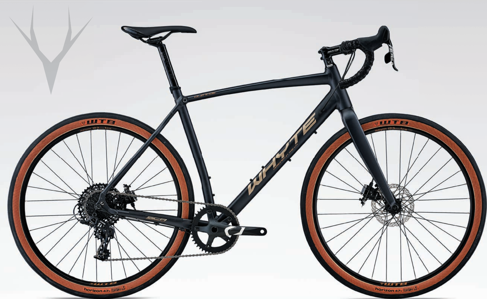
SRAM APEX 1 levers combined with Tektro HyRd hydraulic disc brakes / SRAM APEX 1 drivetrain / WTB tubeless ready rims and Horizon Road Plus 650b x 47c tyres ROADPLUS/ADVENTURE