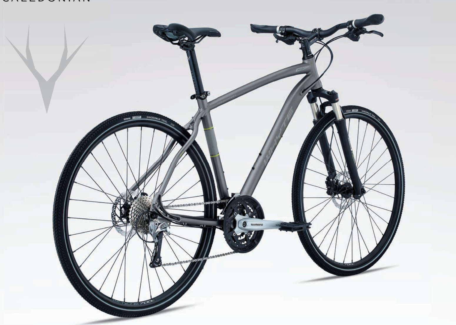
Lightweight aluminium frame / Integrated Kickstand / Wide-ratio 3x10spd Shimano Deore LX gearing / Vittoria Randonneur 35c Trail tyres with double puncture protection ALL TERRAIN/LEISURE - C7 SERIES