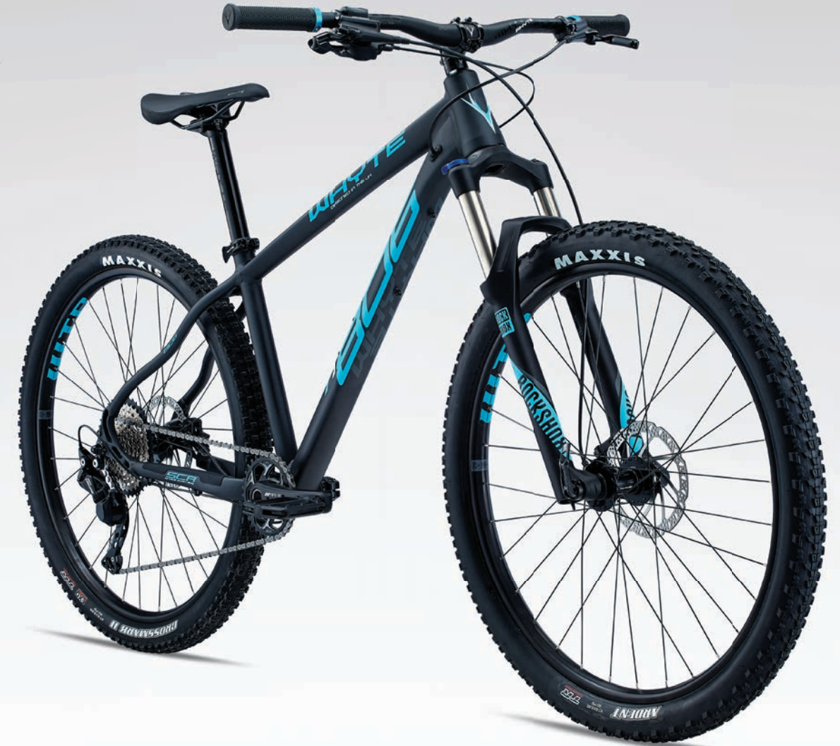
Shimano Deore M6000 1 by 10 drive-train / Compact geometry and sizing down to XS for smaller riders / Adjustable air-sprung RockShox Judy TK suspension fork TRAIL HARDTAIL - 800 SERIES - 120MM