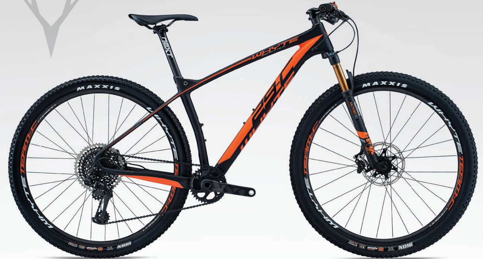
Fox Factory SC 32/ SRAM XX1 1x12spd drivetrain / SRAM Level Ultimate brakes / RaceFace NEXT seat post and 720mm handlebar CARBON PERFORMANCE HARDTAIL 29ER - C29 SERIES