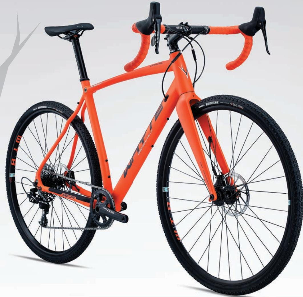
SRAM APEX 1 hydraulic disc brakes / SRAM APEX 1, Long Cage, 11 Speed / WTB tubeless ready rims and Maxxis Rambler 40c tyres GRAVEL/ADVENTURE - GX SERIES