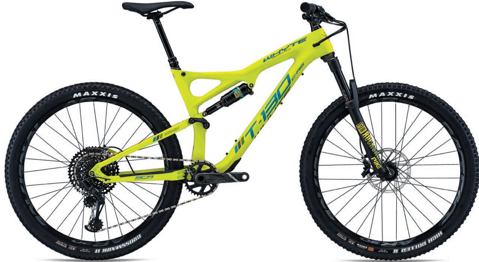
SRAM GX Eagle 12-speed drivetrain / RockShox Pike Boost fork, Monarch DebonAir shock and Reverb Stealth seatpost T-130 TRAIL SUSPENSION - 130MM