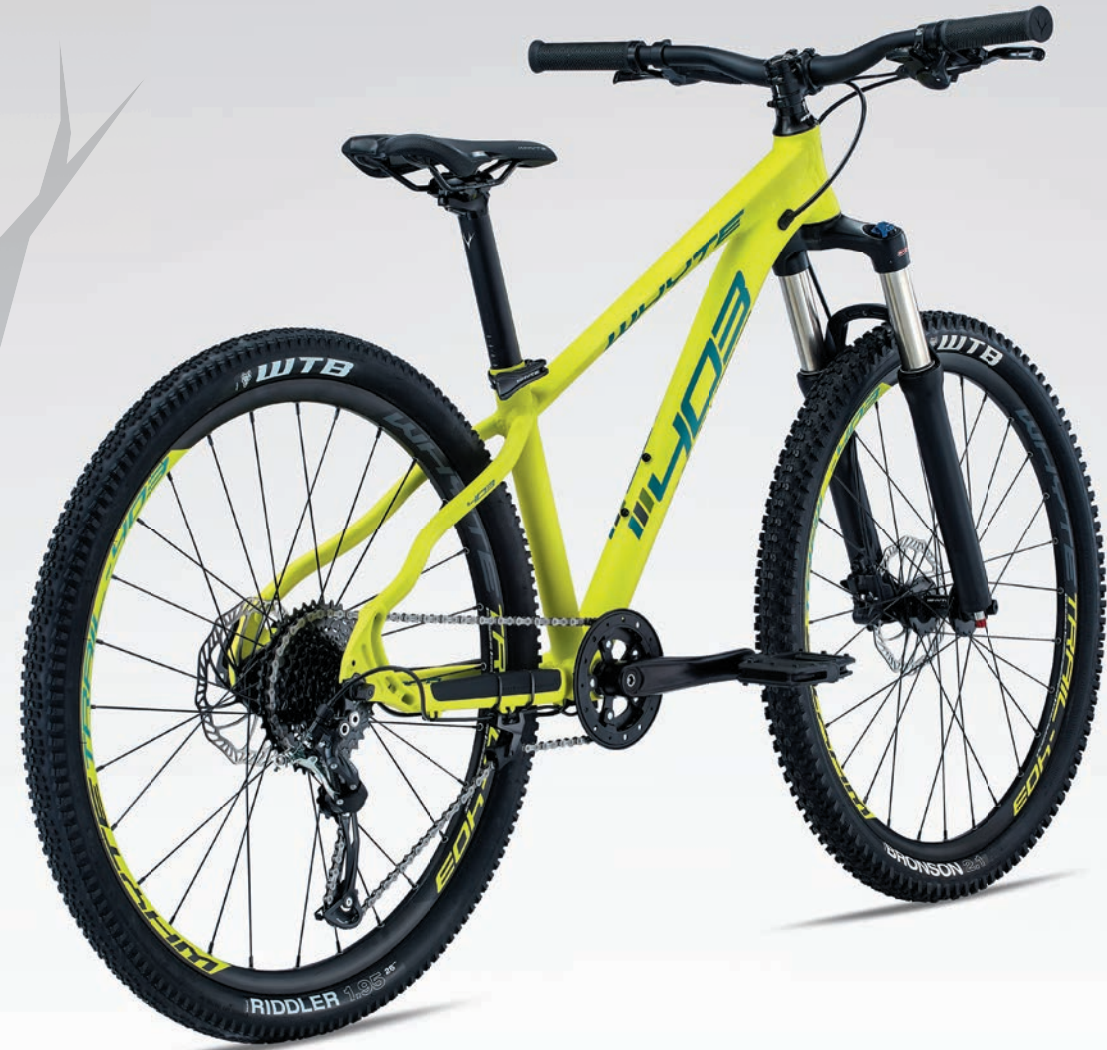
Lightweight aluminium frame with internal cable routing / SR Suntour XCM suspension 100mm fork with adjustable air spring to tune to rider weight / Shimano 1x9spd drivetrain / 11-40T Cassette / Trigger Shifter / Chainstay Guide, Narrow wide Chaining YOUTH 26ER TRAIL HARDTAIL - 400 SERIES - 100MM