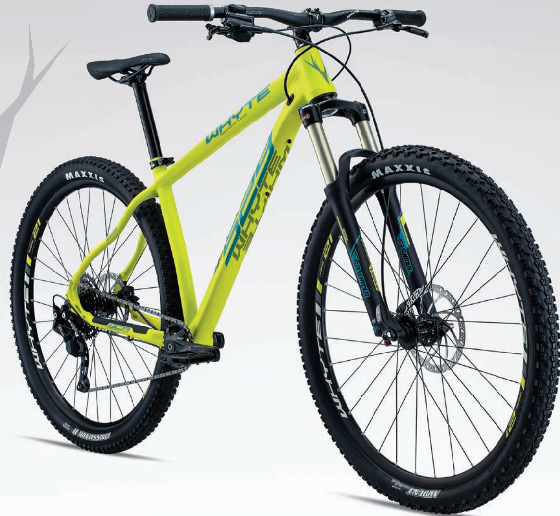
6061 Hydro Formed T6 Aluminium frame / Maxxis front and rear specific tyres / Shimano Deore with Sunrace 10-42 wide range cassette / SR Suntour Raidon front fork with 15mm through axle TRAIL HARDTAIL 29ER - 120MM