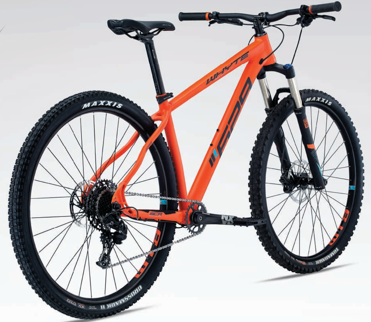
SRAM NX 1 by 11 drivetrain / RockShox Recon Silver TK air-sprung fork with 120mm of travel / Maxxis front and rear specific tyres TRAIL HARDTAIL 29ER - 120MM