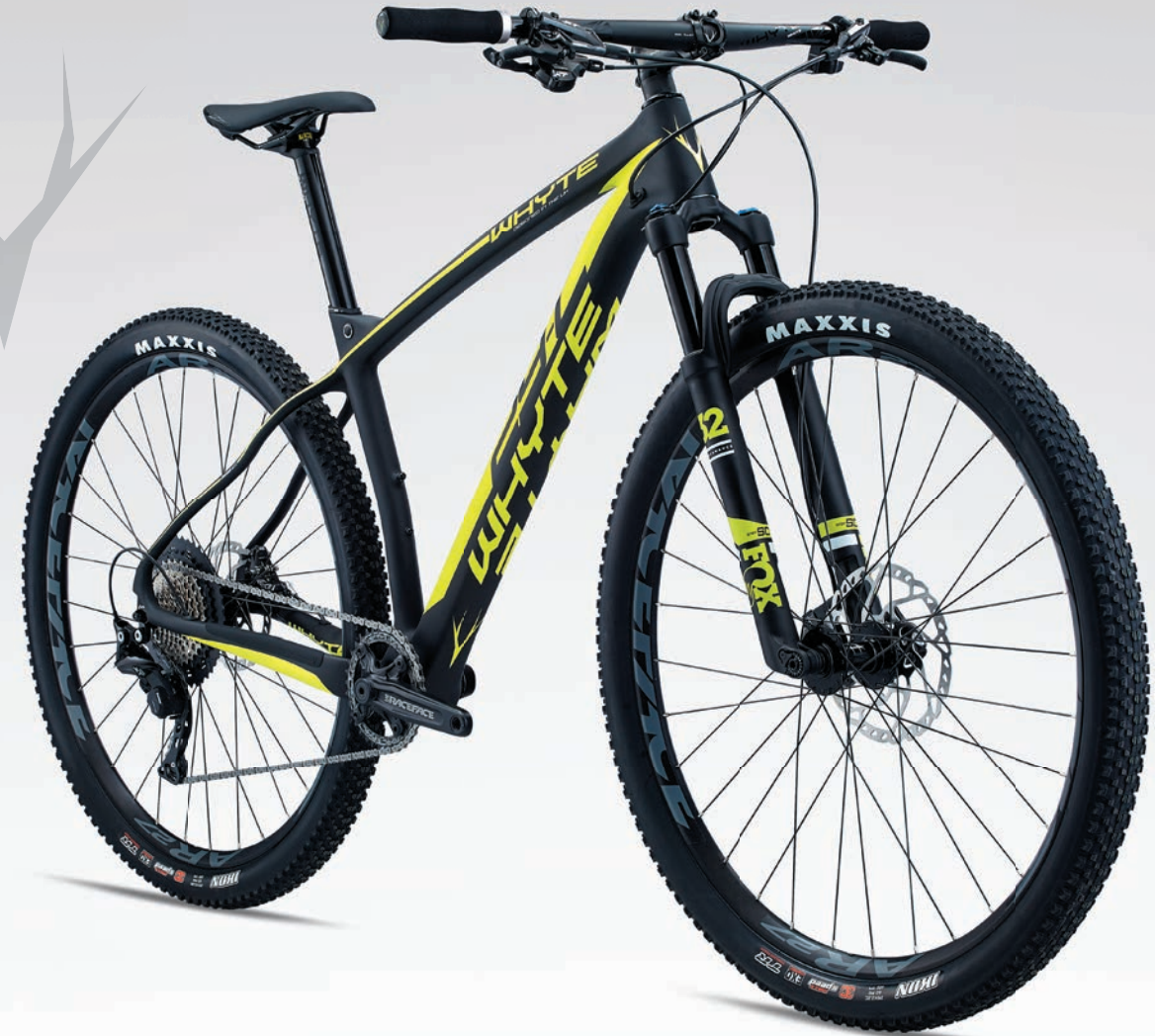
Light and stiff RaceFace/DT/Whyte Wheelset / Shimano XT brakes and 1 by 11 drivetrain / Fox Performance SC fork with Boost hub and 15mm E-Thru CARBON PERFORMANCE HARDTAIL 29ER - C29 SERIES