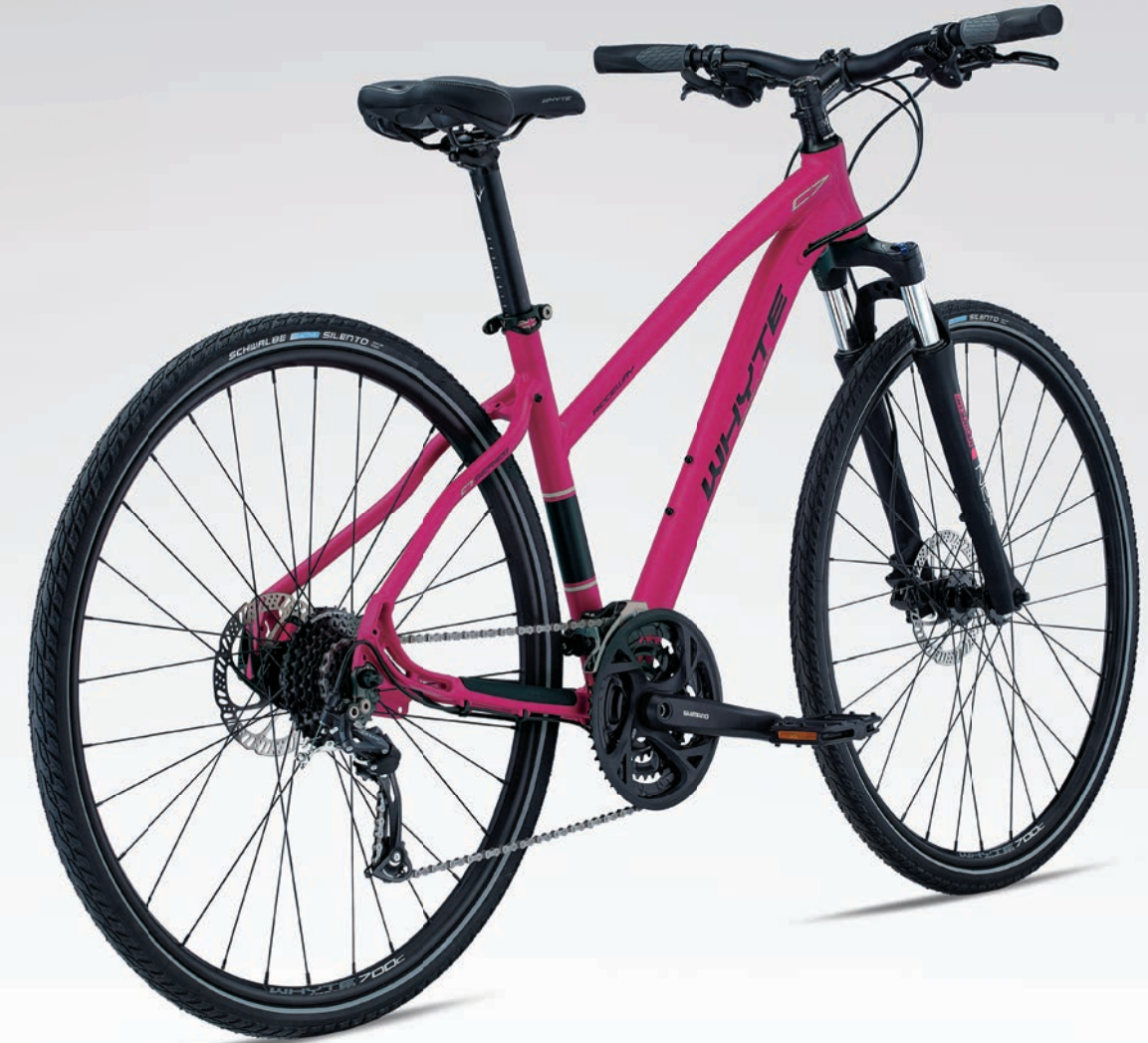
Lightweight aluminium frame / Integrated kickstand mount / SR Suntour suspension fork with Hydro lockout / Shimano 3x9spd gearing / Schwalbe 37c Tyres / Tektro hydraulic disc brakes ALL TERRAIN/LEISURE - C7 SERIES