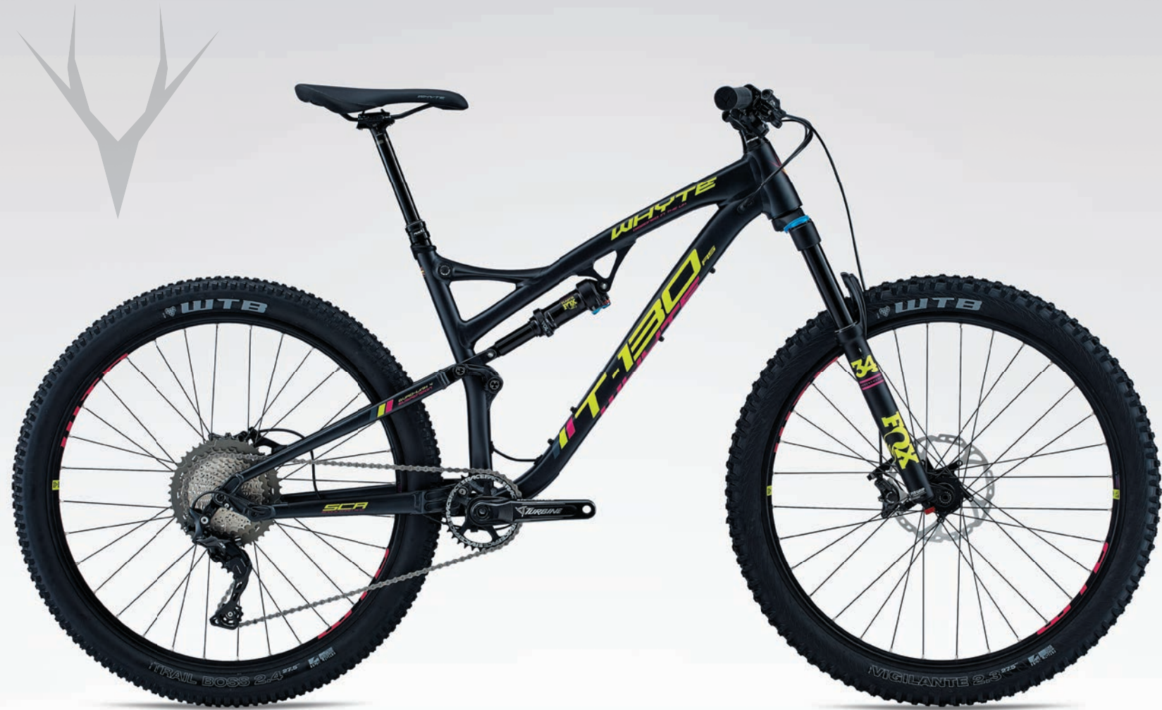
Shimano XT 1 by 11 drivetrain / FOX 34 Performance Elite fork with Float DPS rear suspension/ Reverb Stealth seatpost T-130 TRAIL SUSPENSION - 130MM