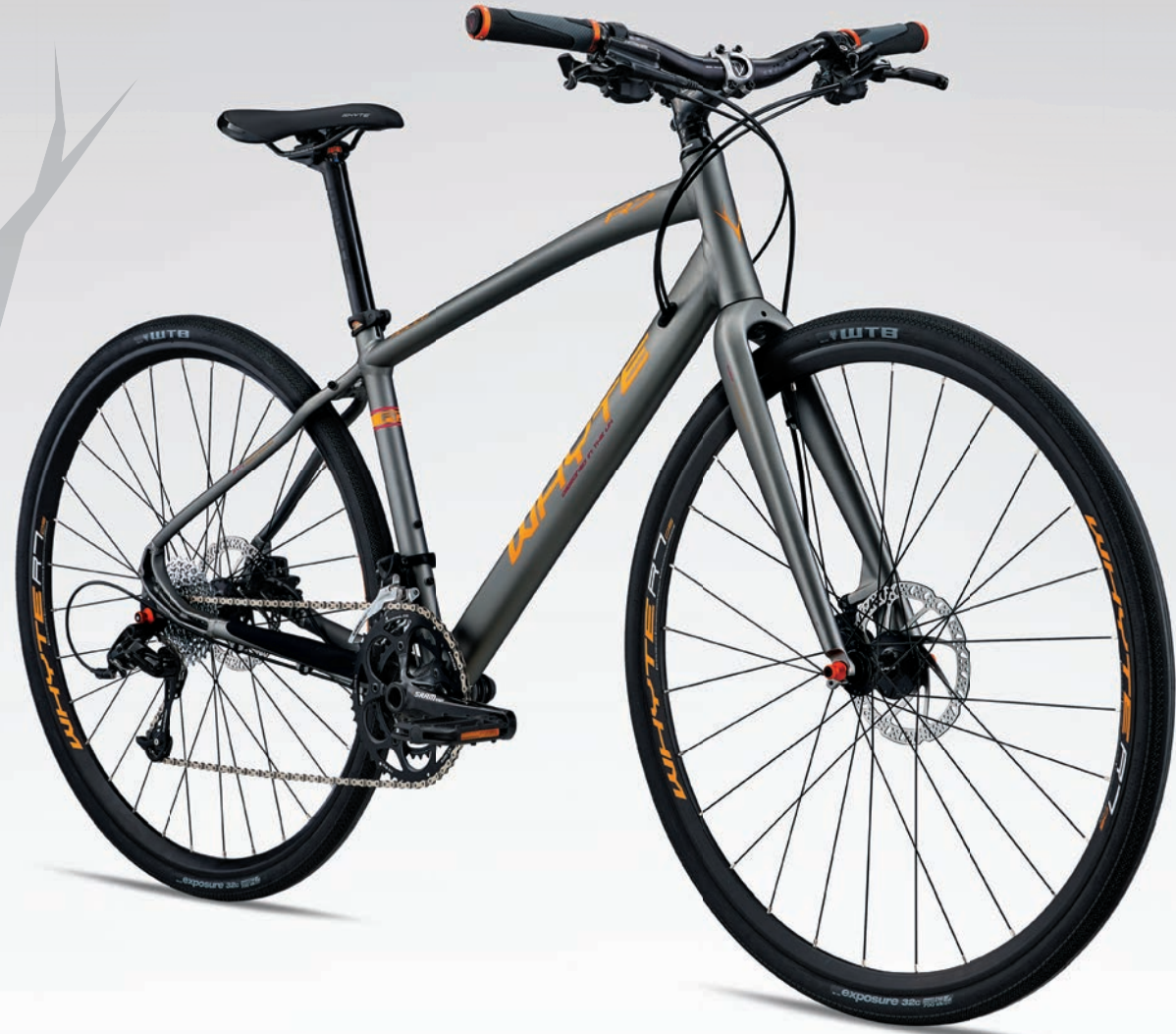
Lightweight aluminium frame with compact geometry / Carbon fibre fork with alloy steerer tube / SRAM 2x10spd compact gearing / Tektro hydraulic disc brakes FAST URBAN/COMMUTER - R7 SERIES