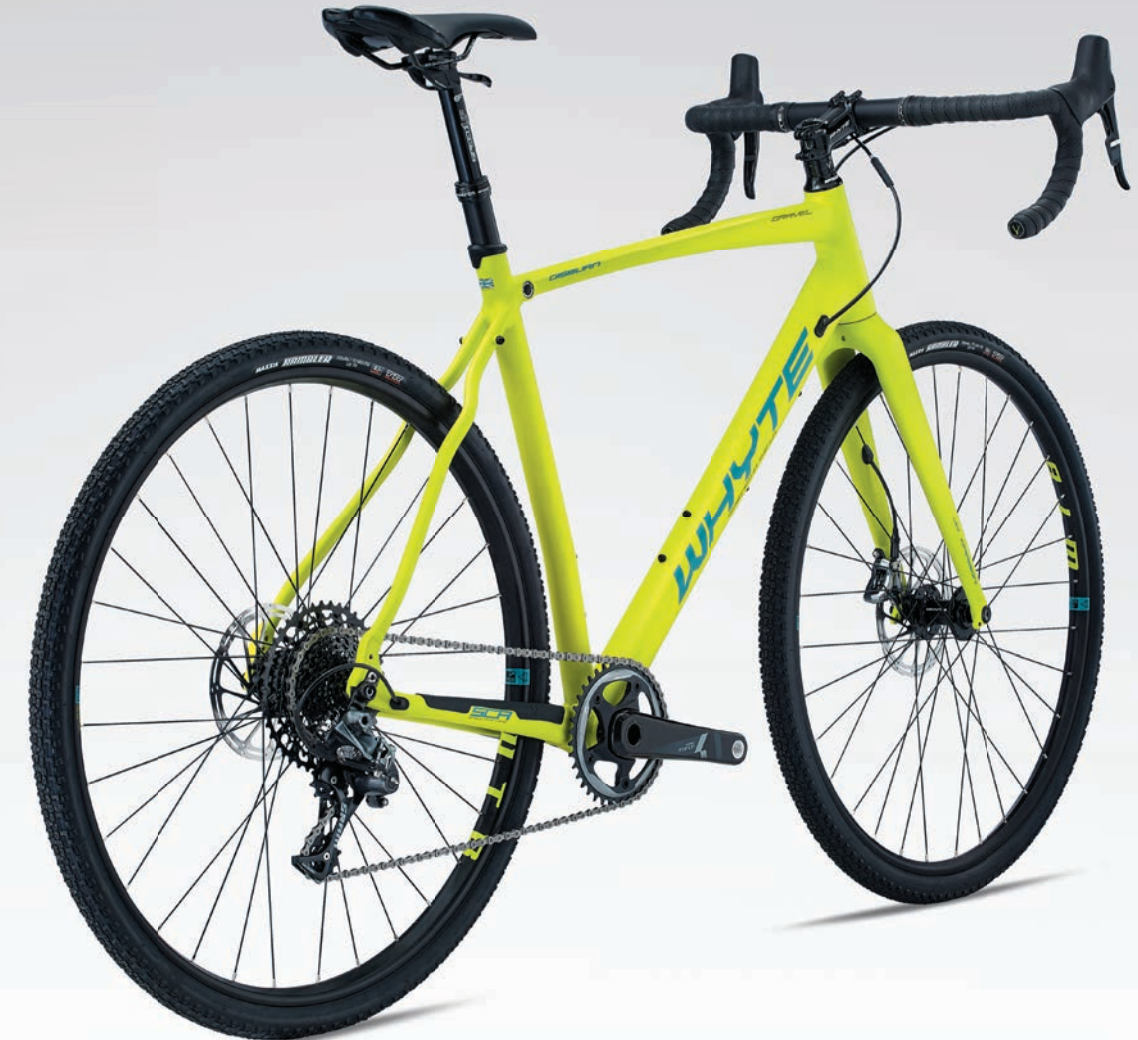
SRAM Force 1 1x11spd drivetrain and hydraulic disc brakes / WTB Asym i23 TCS rims with Maxxis TR Rambler tyres 700 X 40c / KS Speed Up dropper post GRAVEL/ADVENTURE - GX SERIES