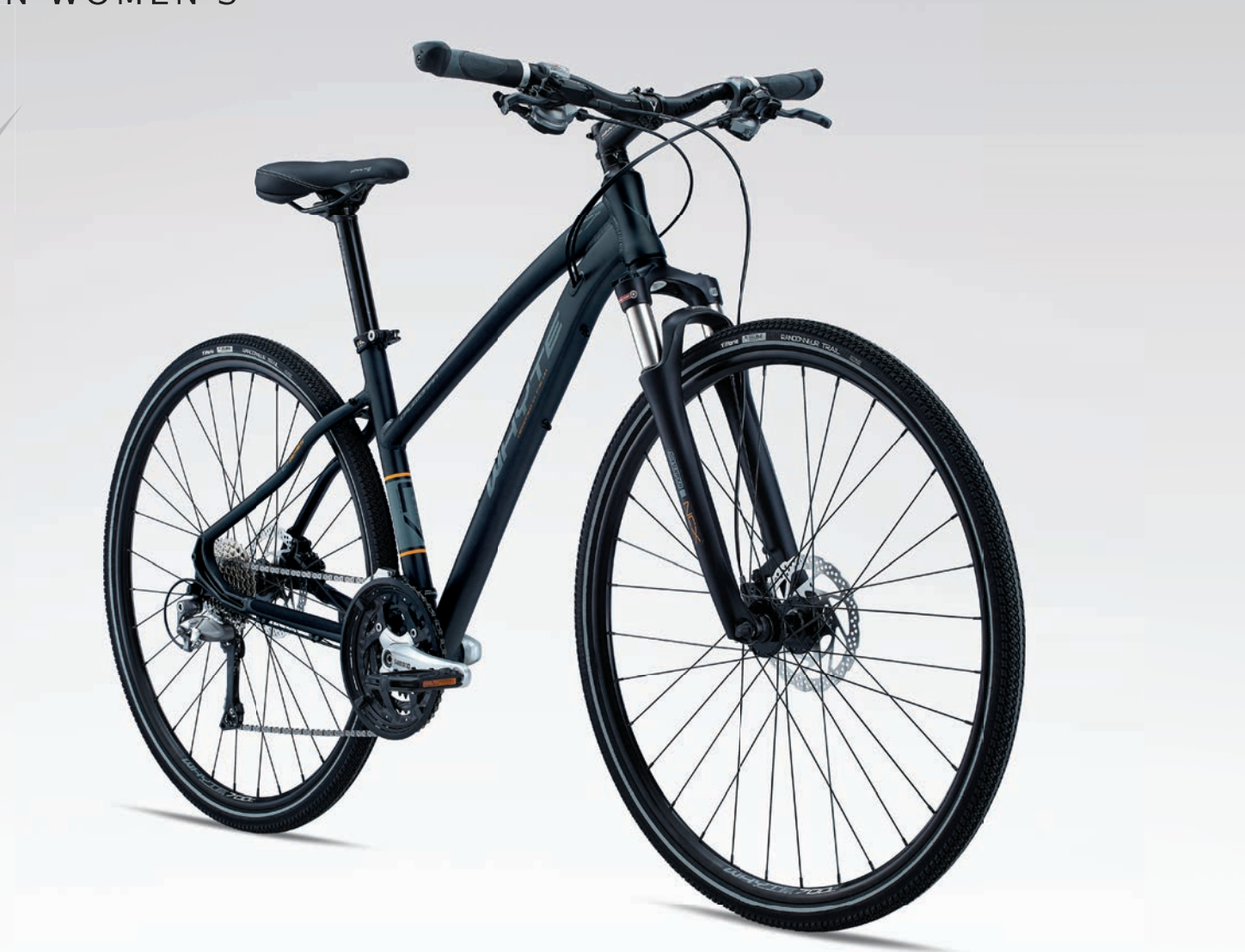
Lightweight aluminium frame / Integrated Kickstand / Wide-ratio 3x10spd Shimano Deore LX gearing / Vittoria Randonneur 35c Trail tyres with double puncture protection ALL TERRAIN/LEISURE - C7 SERIES