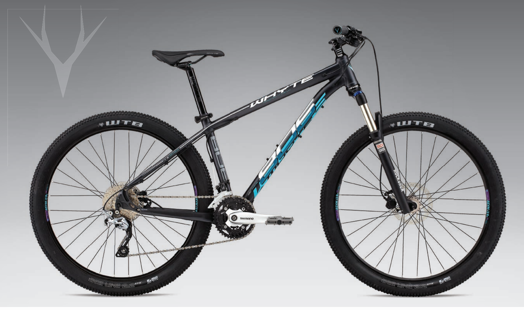
Shimano Deore 3x10spd drivetrain / Compact geometry and sizing down to XS for smaller riders / Adjustable air-sprung RockShox Recon Silver suspension fork X8 PERFORMANCE HARDTAIL 650b/27.5"