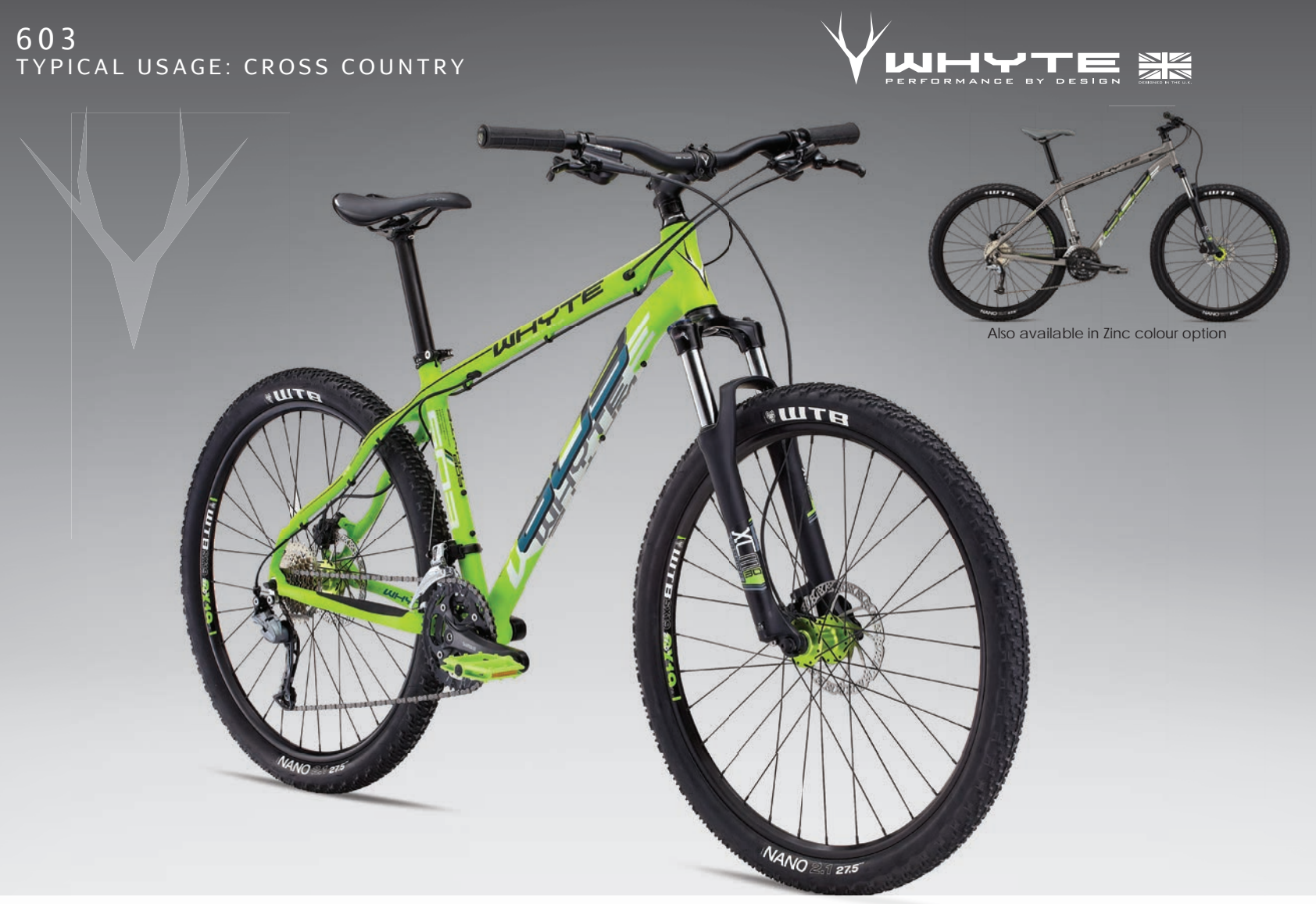
Lightweight aluminium frame with internal cable routing / SR Suntour suspension with lockout feature / Tektro Auriga hydraulic disc brakes X6\ SPORTS\ HARDTAIL\ 650b/27.5"