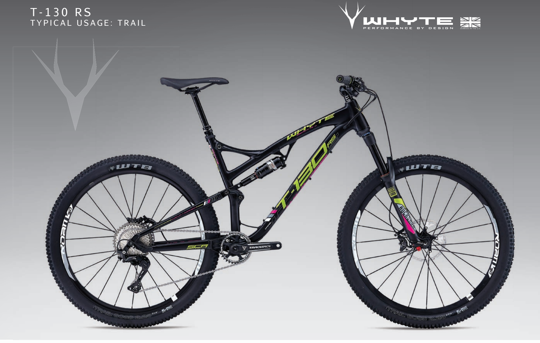
SCR frame with symmetrical chainstays for increased stiffness / Shimano XT 1 by 11 drivetrain / RockShox Pike fork, Monarch DebonAir shock and Reverb Stealth seatpost T-130\ TRAIL\ SUSPENSION\ 650b/27.5"