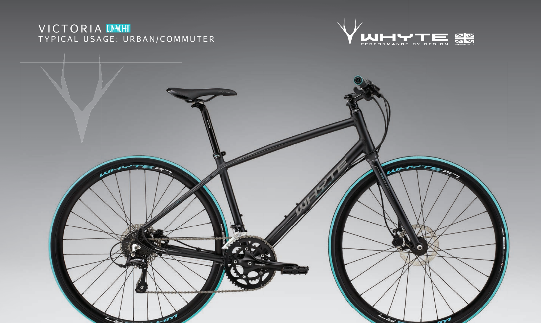
\label{lightweight} \mbox{Lightweight aluminium frame with compact geometry / Shimano 2x9spd drivetrain / Maxxis Rouler tyres with MaxxShield puncture protection \\ \mbox{R7 FAST URBAN SERIES}