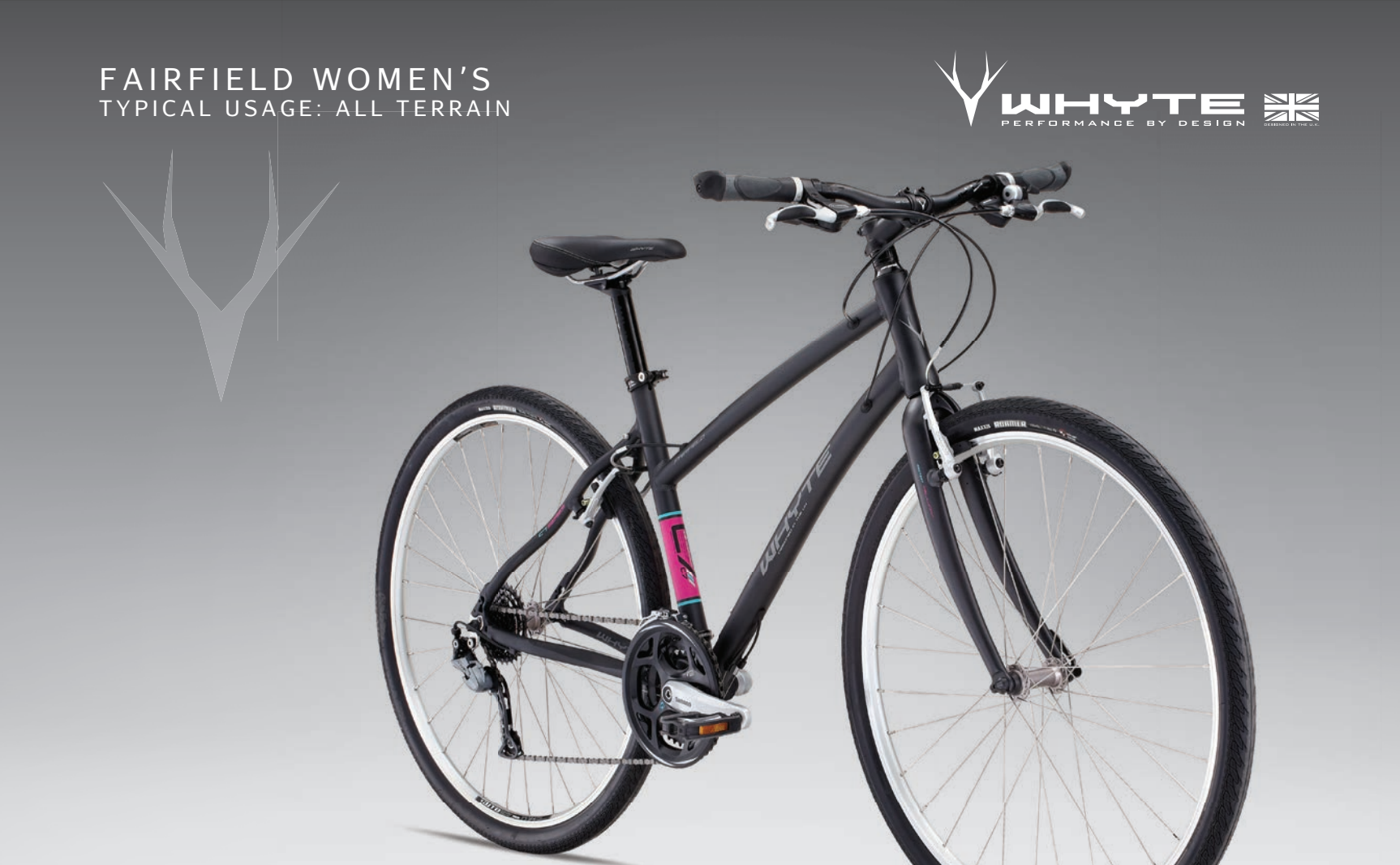
Partially dropped top tube is stronger than a fully dropped frame / Maxxis Roamer tyres with puncture protection / Wide-ratio Shimano gearing C7 ALL TERRAIN WOMEN'S