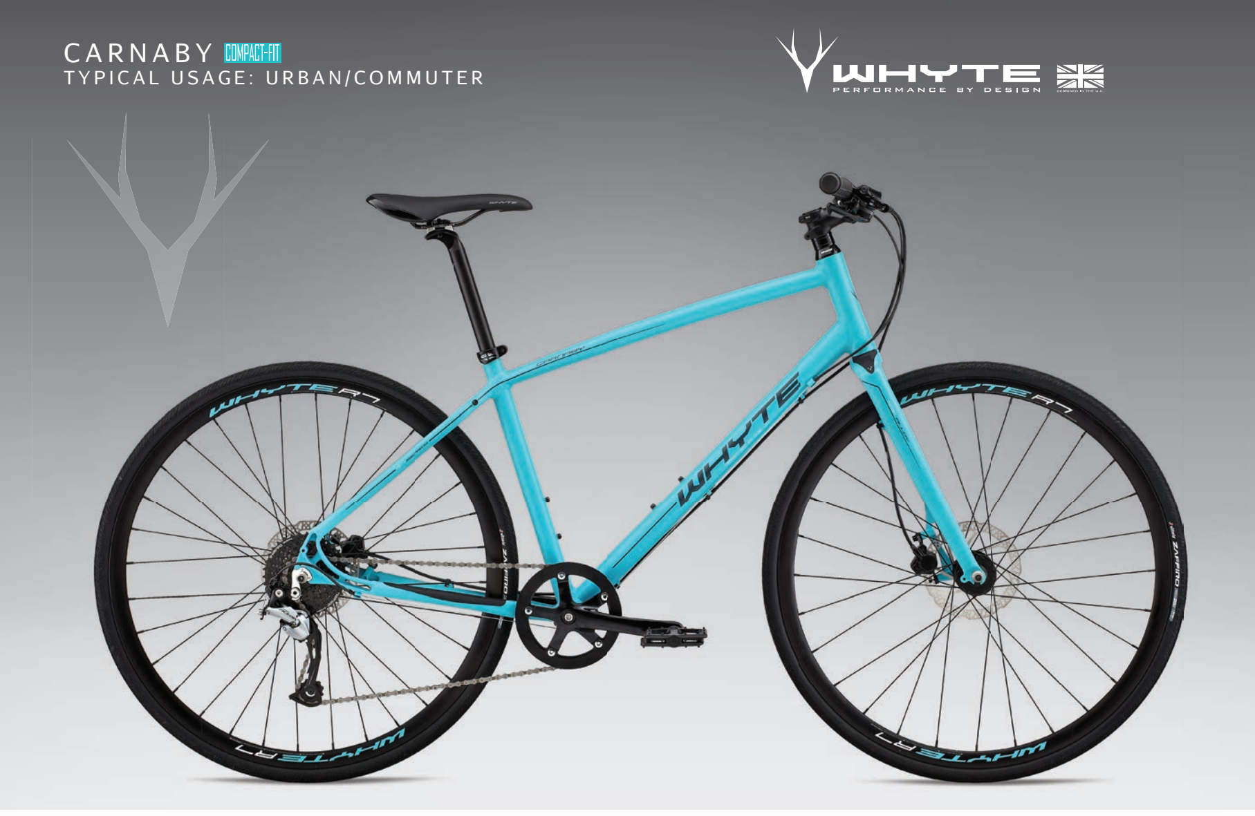
Tektro Auriga hydraulic disc brakes with short reach levers / 1x9spd Shimano drivetrain for urban simplicity / Lightweight aluminium frame with compact geometry R7 FAST URBAN SERIES