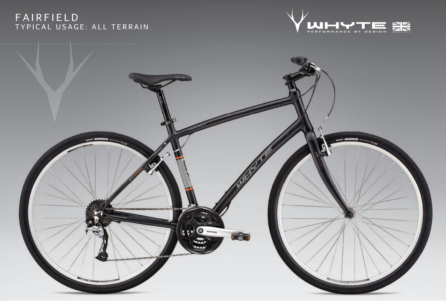
Lightweight aluminium frame / Maxxis Roamer tyres with puncture protection / Wide-ratio Shimano gearing / Powerful V-brakes C7 ALL TERRAIN SERIES