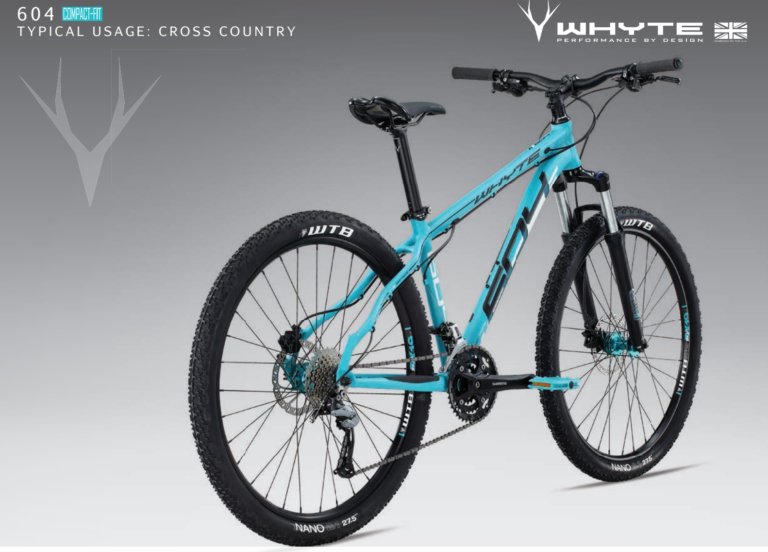
Lightweight aluminium frame with compact geometry for smaller riders / 100mm travel SR Suntour suspension fork / Tektro Auriga hydraulic disc brakes with short reach levers X6\ SPORTS\ HARDTAIL\ 650b/27.5"