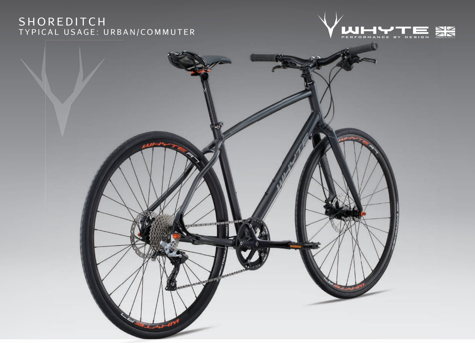
Lightweight aluminium frame / 1x10spd Shimano mountain bike gearing for city-proof performance / Reliable and powerful Tektro hydraulic disc brakes R7 FAST URBAN SERIES