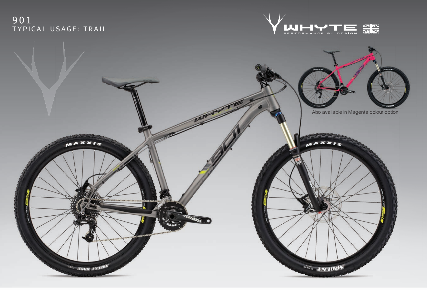
Lightweight and stiff 6061 aluminium frame / RockShox Sektor Gold fork / Whyte custom 750mm bar and size specific stem / Maxxis Ardent tyres TRAIL\ HARDTAIL\ 650b/27.5 "