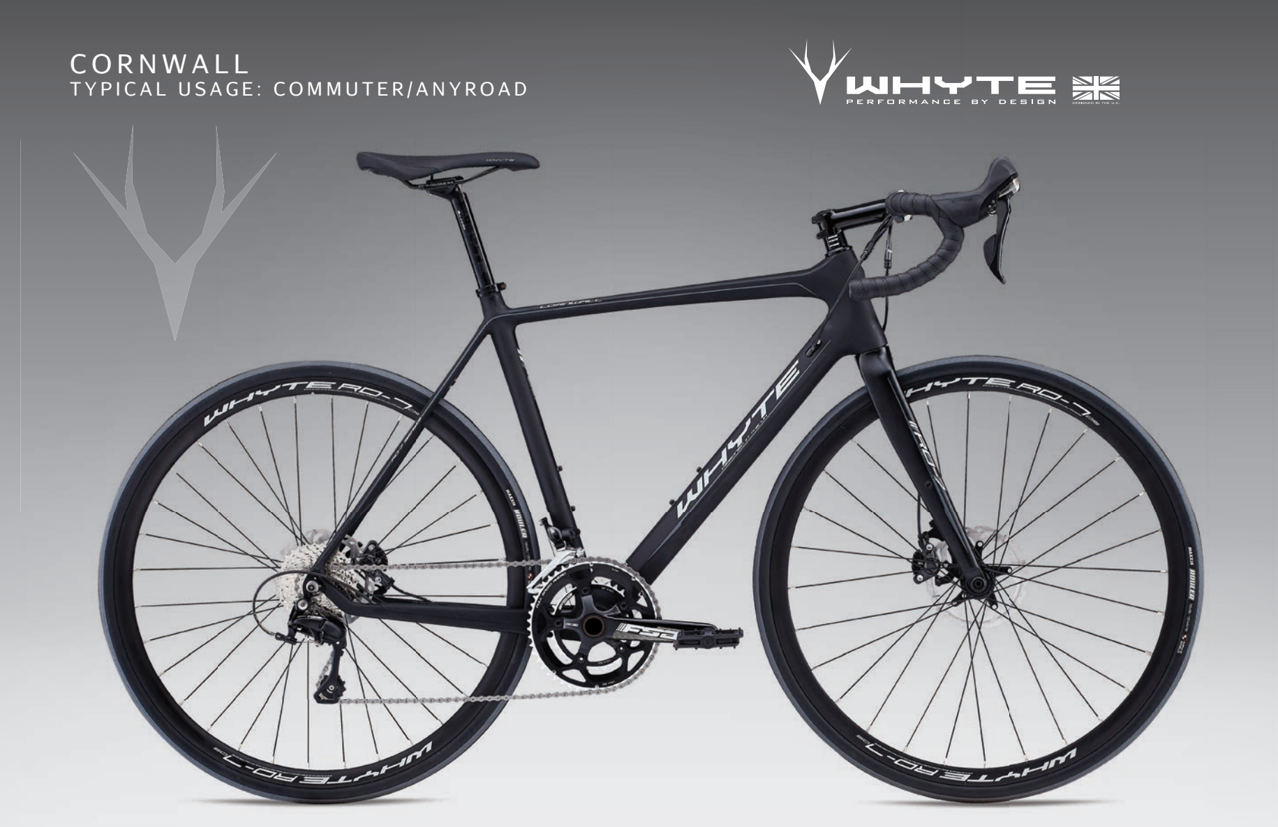
Uni-directional multi-monocoque carbon frame with carbon fork / Shimano 105 fully hydraulic disc brakes / Shimano 105 drivetrain / Internal fork routing RD7 CARBON ROAD DISC

Shimano 105 11-speed drivetrain / Powerful TRP HyRd mechanical/hydraulic disc brakes / Carbon fork with alloy steerer tube / Internal fork routing RD7 DISK ROAD