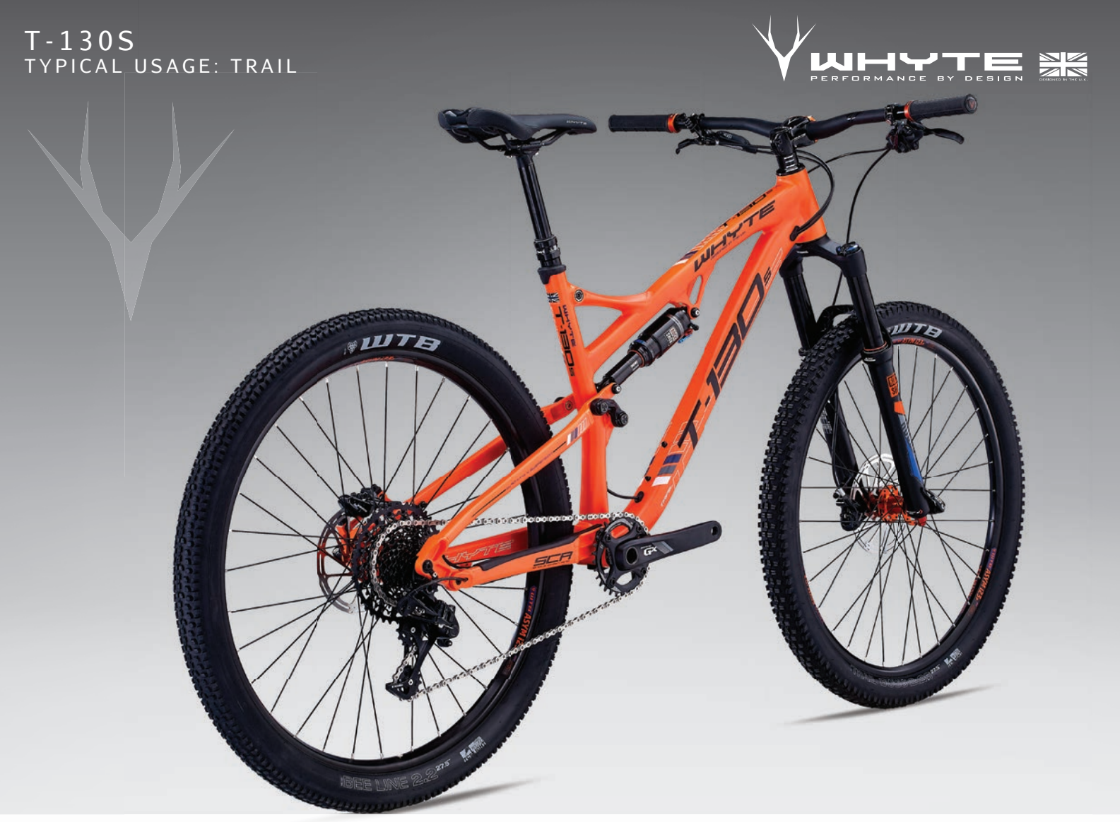
RockShox Yari RL fork with 35mm stanchions / Monarch DebonAir shock and Reverb Stealth seatpost / SRAM 1 by 11 GX Groupset / Stealth Reverb T-130\ TRAIL\ SUSPENSION\ 650b/27.5"